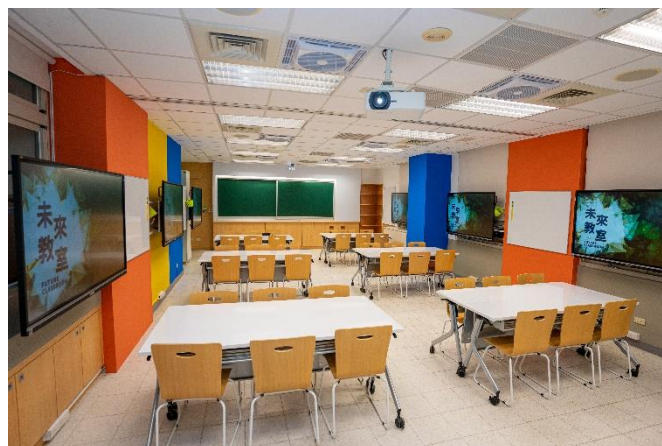
Classroom view from the front door - 1