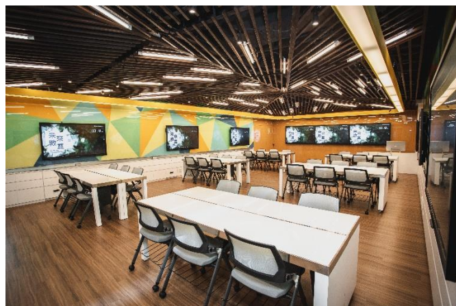
Classroom view from the front door - 1