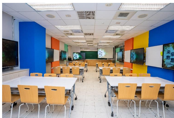
Classroom view from the back