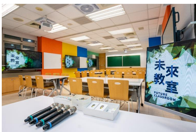
Lectern at the front of the classroom