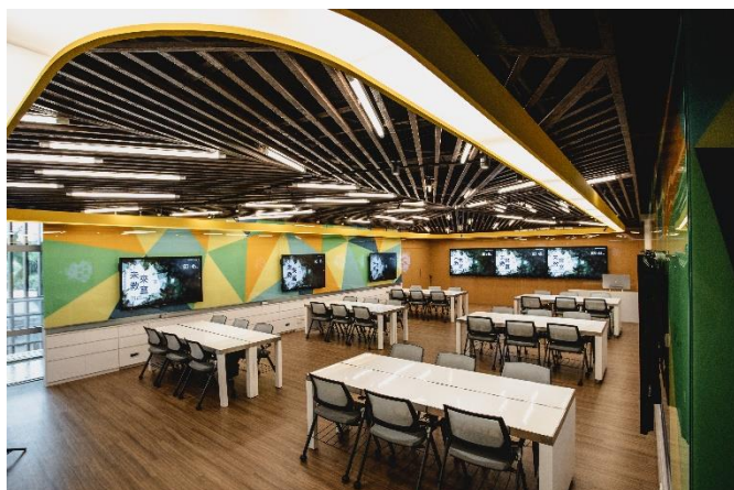
Classroom view from the front door - 2