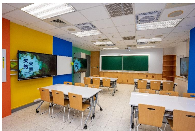
Classroom view from the front door - 2