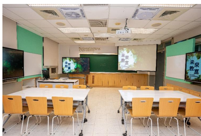
Screens and the blackboard at the front of the classroom