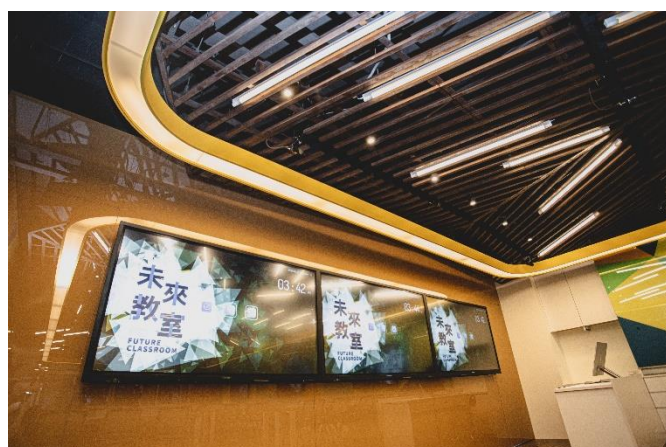
3 screens at the front of the classroom