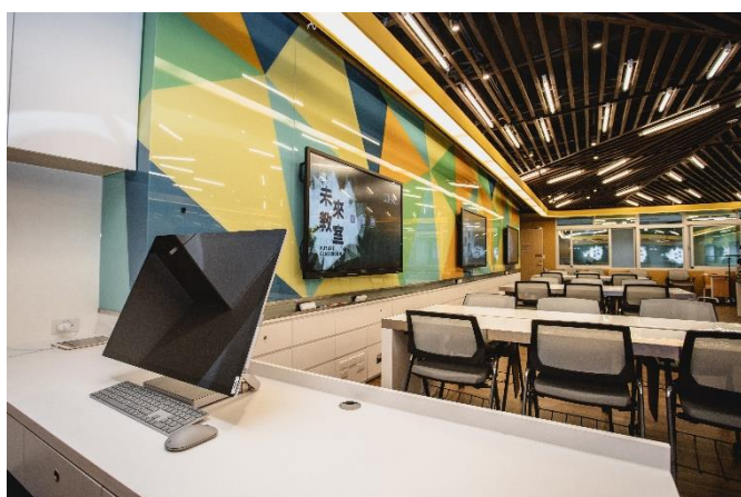
Lectern at the front of the classroom